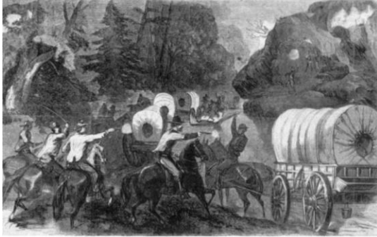
An Exhibition from the Tennessee State Museum and the Tennessee Civil War National Heritage Area

Clement Railroad Hotel Museum January 15 through April 4